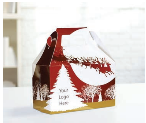
DONUT S1-01106 COOKIE S1-02106 CANDY S1-04106