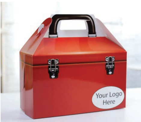
DONUT S1-01104 COOKIE S1-02104 CANDY S1-04104