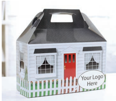
DONUT S1-01102 COOKIE S1-02102 CANDY S1-04102