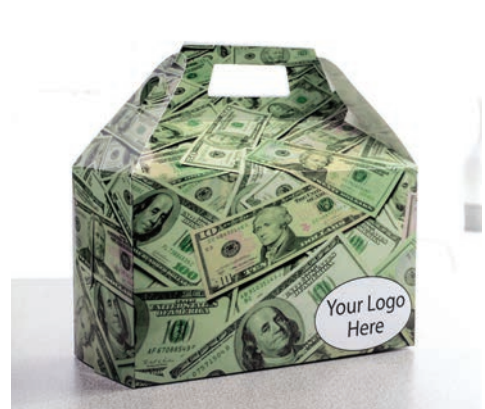
DONUT S1-01103 COOKIE S1-02103 CANDY S1-04103