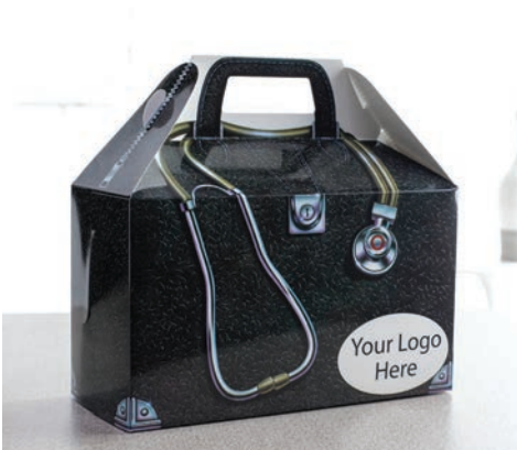
DONUT S1-01101 COOKIE S1-02101 CANDY S1-04101

If you don't have the time or resources to create custom graphics, our stock designs offer beautiful quick-turn solutions.