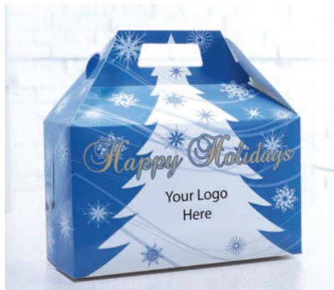
DONUT S1-01105 COOKIE S1-02105 CANDY S1-04105