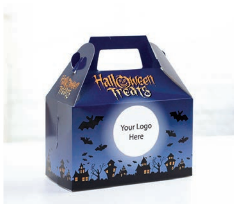
DONUT S1-01109 COOKIE S1-02109 CANDY S1-04109