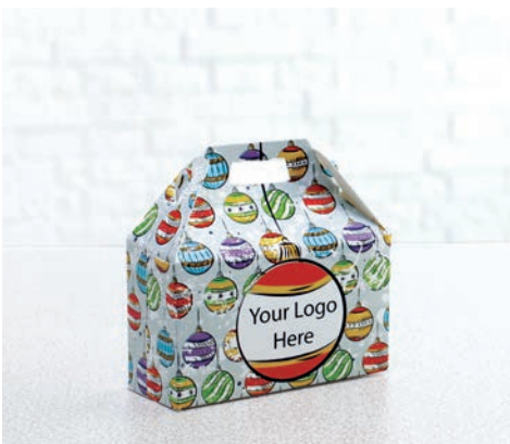
DONUT S1-01108 COOKIE S1-02108 CANDY S1-04108